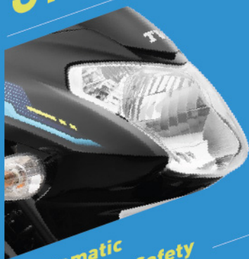
a. Automatic Headlight for Safety Improves visibility. increases safety