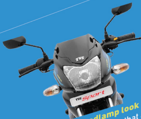
b. Sporty Headlamp look Bold headlamp design that adds a sporty edge to every ride.