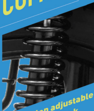
a. 5 Step adjustable hydraulic shock absorber (Rear) Rear suspension that adjusts to every road.