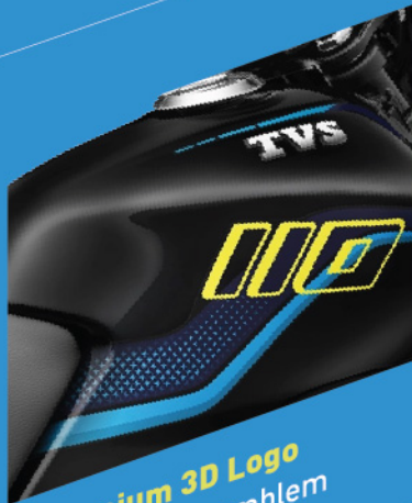
c. Premium 3D Logo The chrome 3D emblem boosts style.