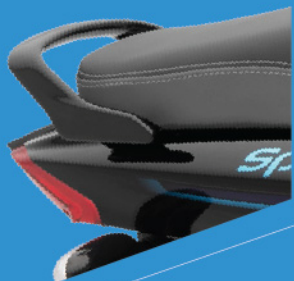
e. Aluminium Grab Rail Offers pillion safety and luggage mounting.