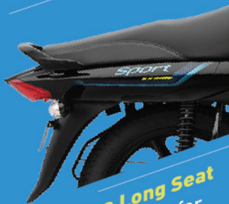
b. Extra Long Seat Extra-long seat for all-day comfort.