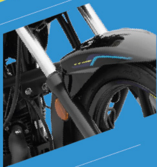
c. Telescopic, oil-damped suspension Twin forks smooth out bumps for a more comfortable ride.